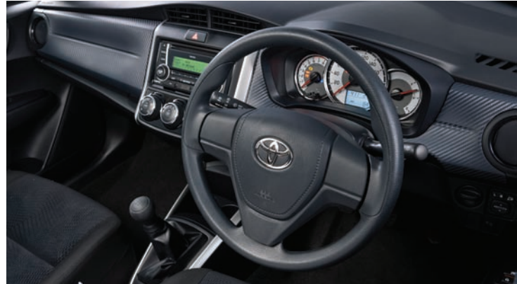
Sit behind the Corolla Wagon steering wheel and enjoy the smartly designed dash layout.