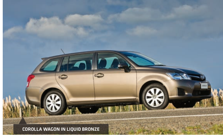
COROLLA WAGON IN LIQUID BRONZE

Corolla Wagon shown accessorised with TRD Front and Rear Spoilers and aftermarket 17" alloy wheels. Contact your local authorised Toyota dealer for a range of accessories to enhance style and/or functionality.