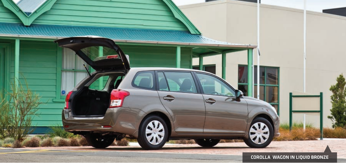
COROLLA WAGON IN LIQUID BRONZE