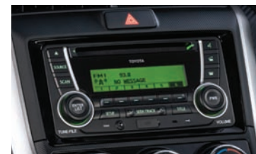
Corolla Wagon's audio system has Bluetooth phone connectivity so you can receive handsfree phone calls on the go.