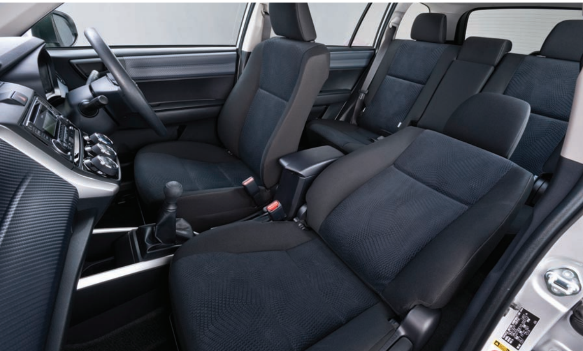
Created for comfort, the supportive seating in Corolla Wagon features high grade black seat fabric with blue wave accents .