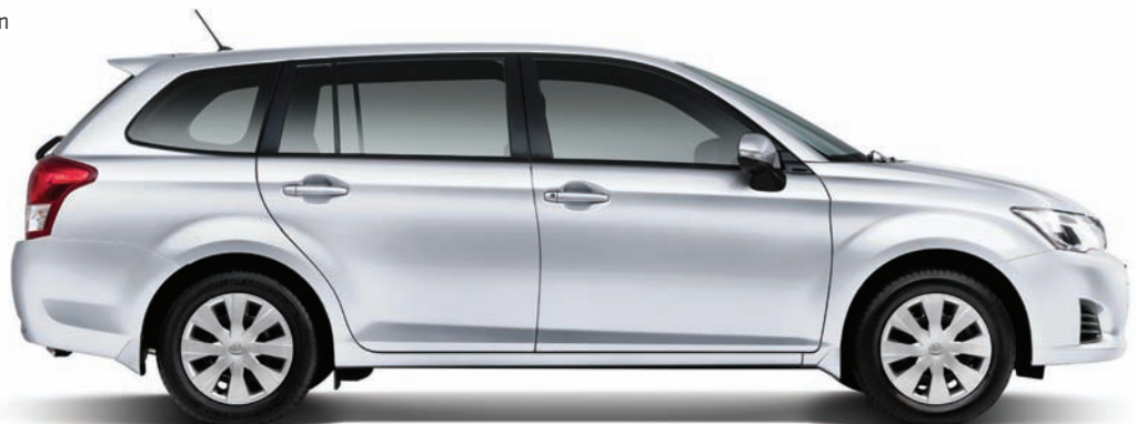
COROLLA WAGON IN SILVER PEARL