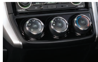
The large easy to use dials of the air conditioning system allow for quick adjustments.