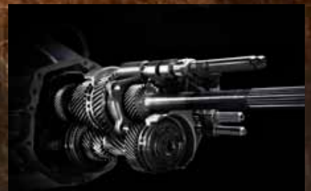
The shift feeling and gear ratios of the 86 were optimised for the manual transmission. The 86 automatic transmission lock-up clutch engages at a lower speed for sharper acceleration response, minimising shift times and heightened driving enjoyment.