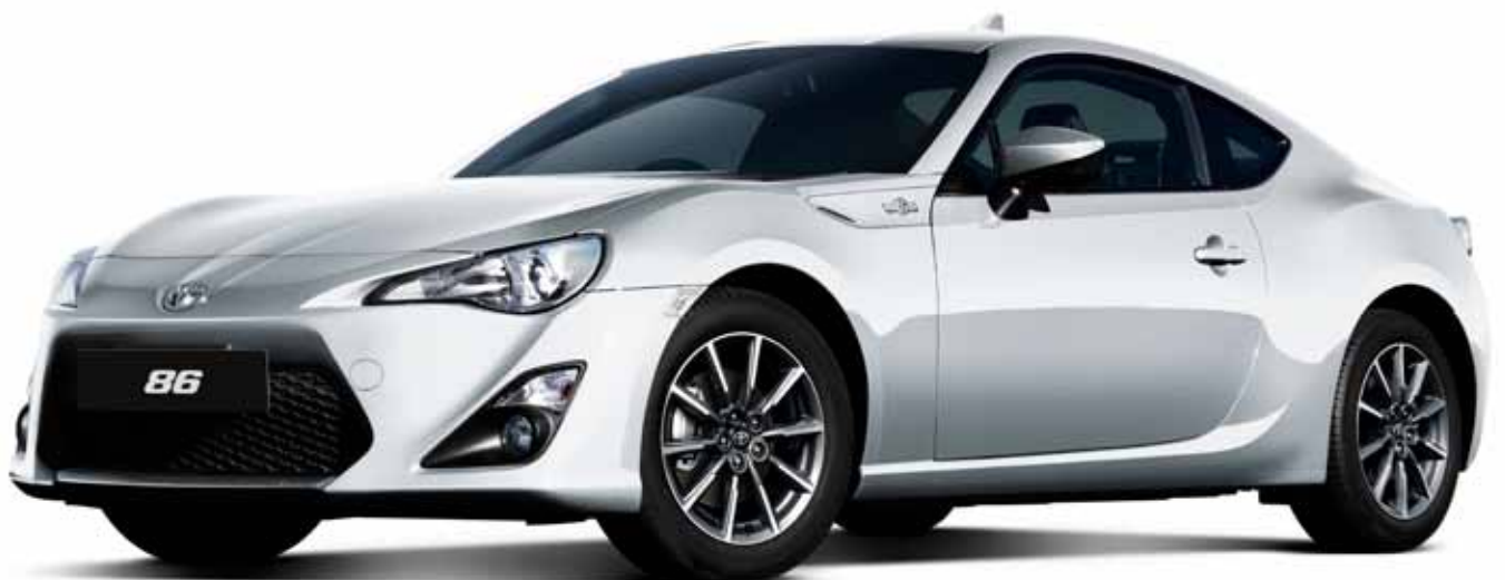
86 IN CRYSTAL WHITE