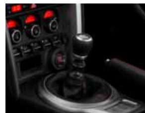
The 86's weighted gear knob enhances the shortness of the shift. The shift itself has a silver-accented surround, in the shape of the 86's conrod. Many of the 86's styling attributes hint at this distinct engineering feature.