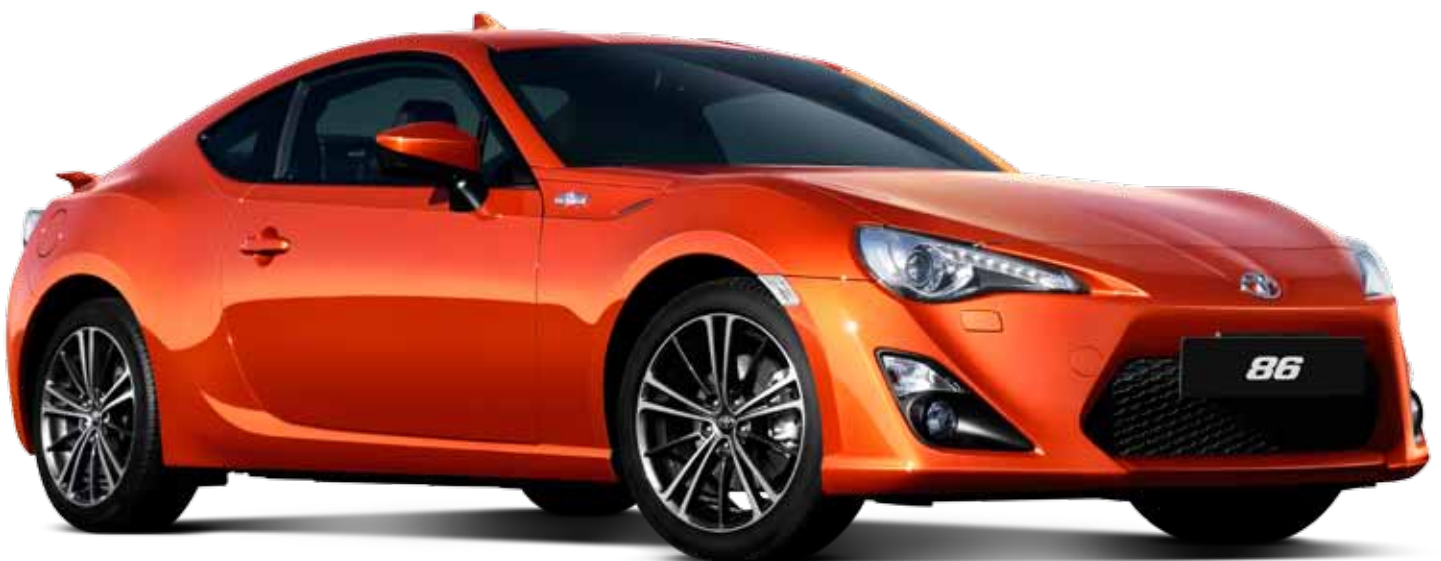
GT86 IN BURNT ORANGE