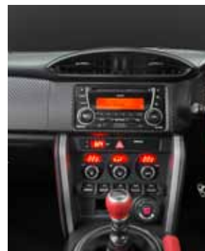
Even in a sports car of the 86's pedigree you can expect the convenience and ease-of-use of a 6.1" touchscreen display audio system. This is your access point to Bluetooth hands-free phone and audio streaming capabilities as well as iPod control via the USB port.