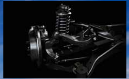
MacPherson strut front and lightweight but strong double wishbone rear suspension add extra grip and agility to an already perfectly balanced vehicle.