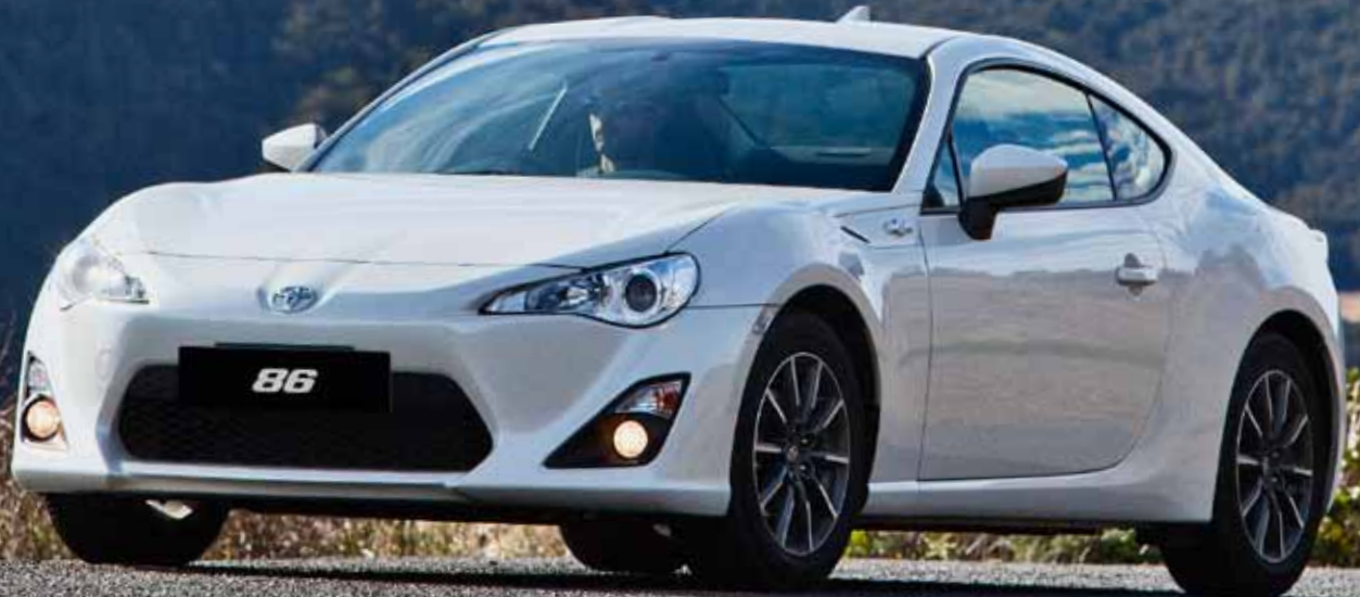
86 IN CRYSTAL WHITE

How do you make every corner epic? By doing away with unusable horsepower and electronic interfaces and replacing it with a sports car designed from the ground up to put the driver back in control.