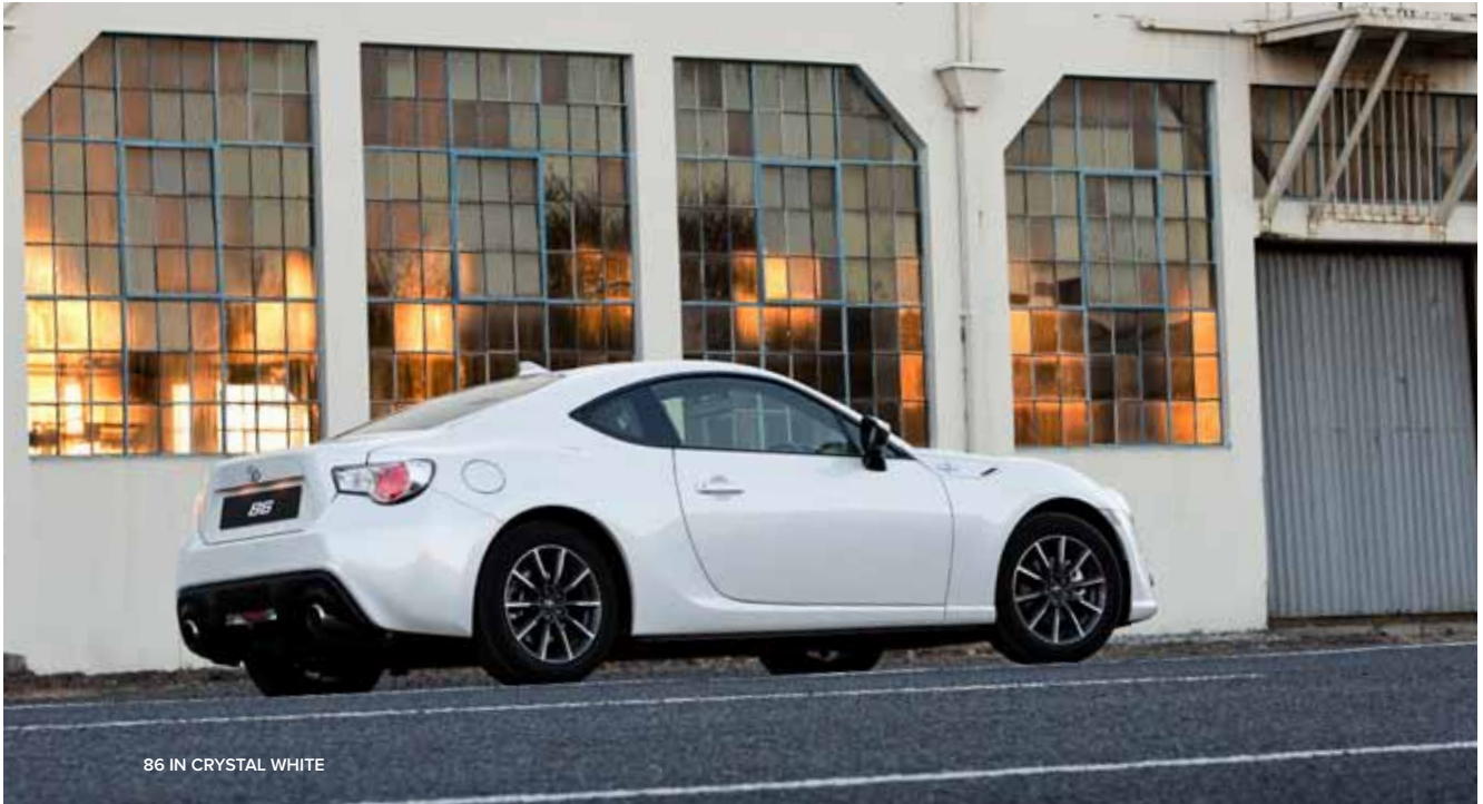
86 IN CRYSTAL WHITE

The Toyota 86 puts thrilling sports driving back into the hands of everyone. From initial drawings, through to the stunning vehicle you see today, the 86 was designed by passion, not committee, with one goal in mind: to make driving fun again.