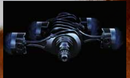
The boxer engine's naturally balanced four horizontally opposed pistons and square, 86mm x 86mm bore and stroke lie at the heart of the 86's design. The engine's low positioning allowed for the vehicle's ultra-low centre of gravity, and low-inertia cornering.