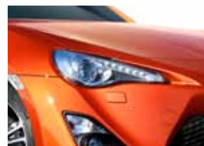
The 86's manual levelling halogen headlights, low profile front bumper and Daytime Running Lights (DRL) combine to lend the 86's front styling an aggressive road presence. GT86's auto levelling HID headlights feature LED Daytime Running Lights (DRL) within the headlight.

Both manual and automatic 86s' come with a Torsen (Torque Sensing) Limited Slip Differential. The LSD can help maximise traction by allocating power to the drive wheel with the greatest amount of grip.