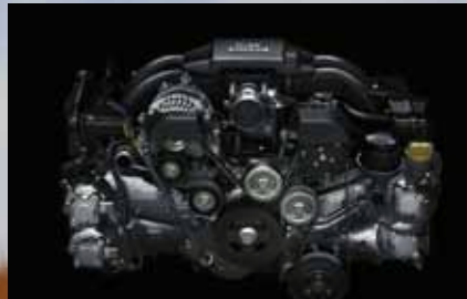
The 86's 2.0L front boxer engine has D-4S direct injection to provide you with power when you need it. The engine achieves a 147kW @ 7,000 rpm and has 205Nm of torque @ 6400-6600 rpm. At 5000 revs the car's attitude changes and it's on!