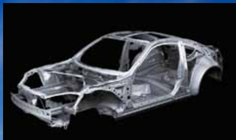
The aluminium hood, and lightweight but extra-strong chassis and body of the vehicle, were designed to the latest safety standards.