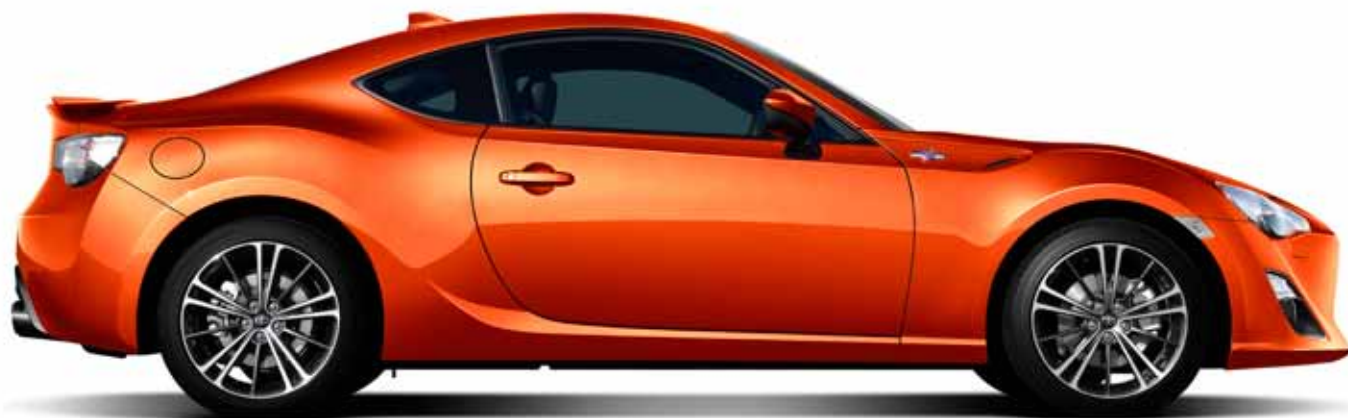
GT86 IN BURNT ORANGE