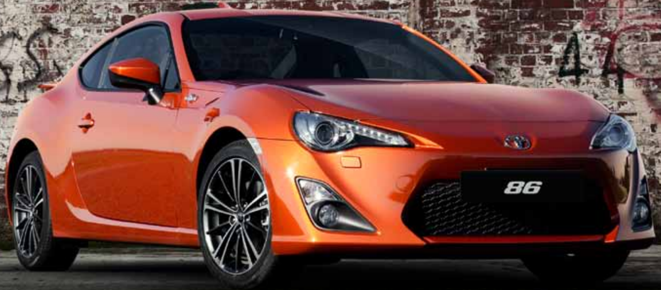
GT86 IN BURNT ORANGE

The GT86 adds flare, with every detail carefully considered to make you feel like a motorsport superstar from the second you slip into the driver's cockpit.