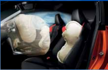
Seven airbags provide a comprehensive curtain of protection, including a driver's knee airbag.