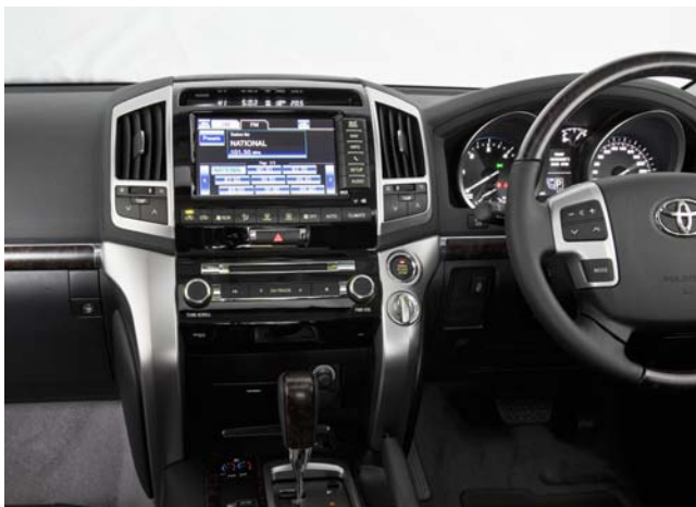
The 8" EMV with Satellite Navigation is the information centre displaying everything from climate control to the reversing camera image.

From the outside Land Cruiser 200 presents a commanding presence. Sitting behind the steering wheel you will have a sense of being in command.