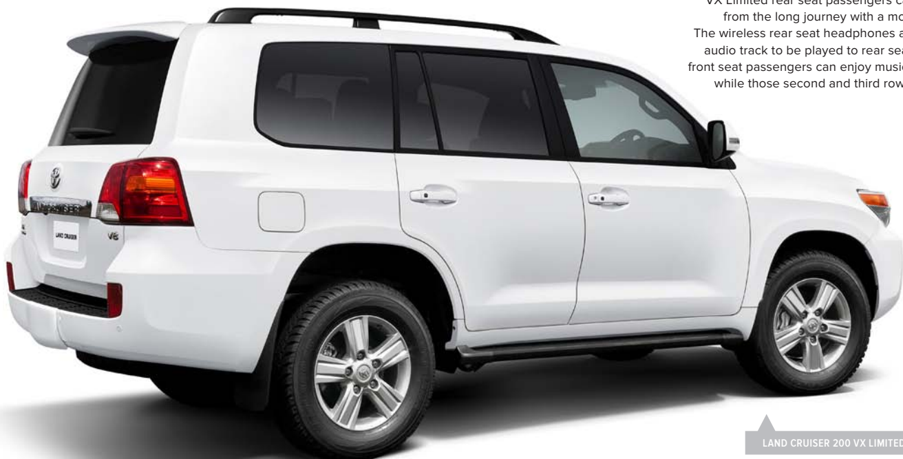
LAND CRUISER 200 VX LIMITED IN CRYSTAL PEARL