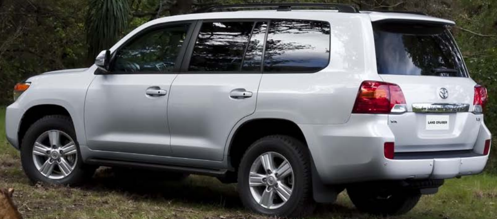
LAND CRUISER VX IN SILVER PEARL

has the on-board technology, and performance to comfortably and confidently cope with everything, from crawl to cruise wherever you find yourself.