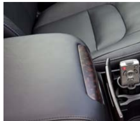
Although there's vast luggage space in the back Land Cruiser 200 has many smaller storage spaces.