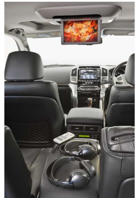
VX Limited rear seat passengers can enjoy a break from the long journey with a movie interlude. The wireless rear seat headphones allow for a different audio track to be played to rear seat passengers so front seat passengers can enjoy music or a radio channel while those second and third rows enjoy a DVD.