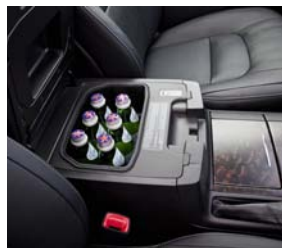
Occupants in VX Limited can enjoy chilled refreshments while en-route.