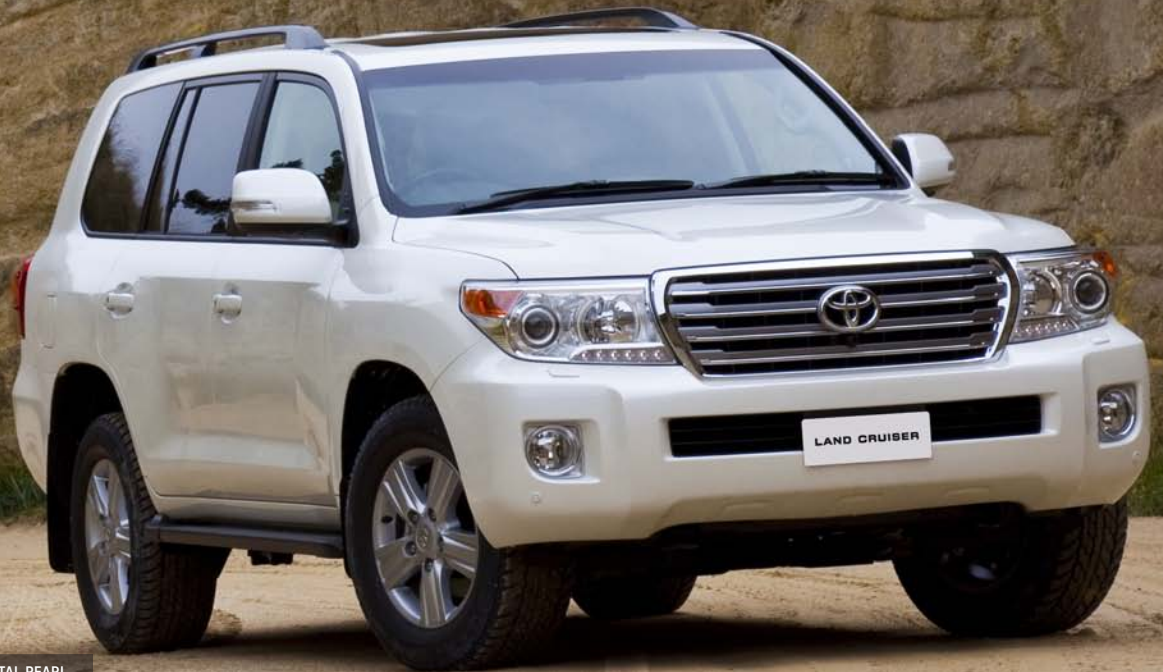
LAND CRUISER VX LIMITED IN CRYSTAL PEARL