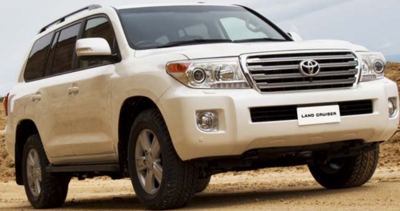
LAND CRUISER VX LIMITED IN CRYSTAL PEARL