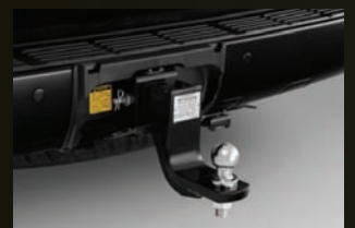
Towing kit - 3500kg capacity.