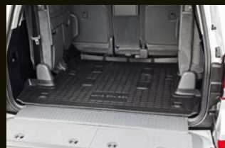
All Weather Cargo Liner.