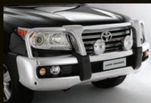
Alloy Bull Bar - airbag compatible.

If you plan to go far beyond the road end, carry messy loads and tow the boat there then your Toyota Dealer can help with a range of Genuine Accessories tailored to enhance Land Cruiser 200. Accessories shown are sold separately.