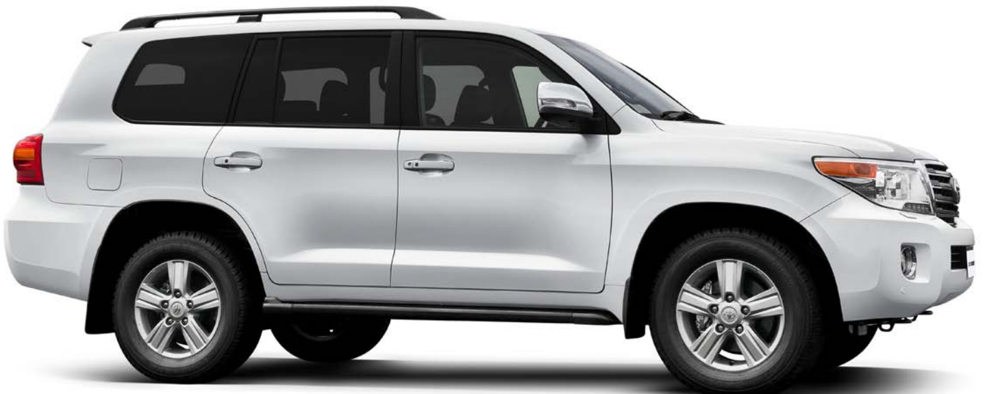
LAND CRUISER 200 VX IN SILVER PEARL

The plush moquette fabric seats in VX offer all day comfort.